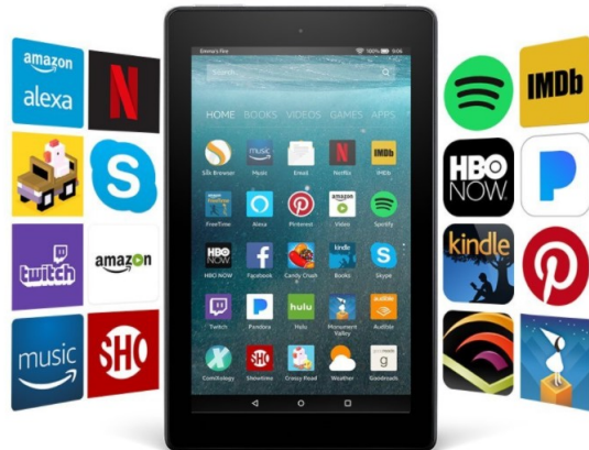
Amazon Fire 7 Tablet